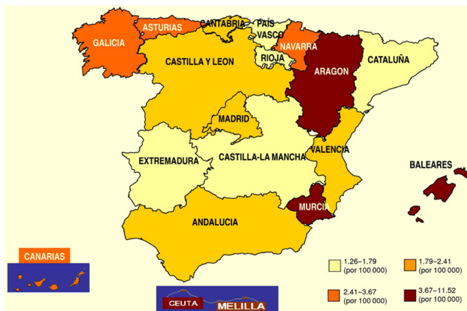
Figure 3 Syphilis related hospitalisation rate by region in Spain (1997–2006).

Figure 3 shows the distribution of hospitalisation rates by region. The autonomous communities that had the highest hospitalisation rates were Ceuta and Melilla, with 6.78 and 11.52 per 100 000 population, respectively, and the lowest rates were found in Castilla La Mancha and the Basque Country, with 1.26 and 1.35 per 100 000 population, respectively.